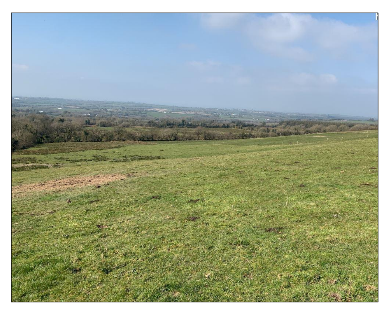
Plate 3.1: General View across the Proposed Development Site