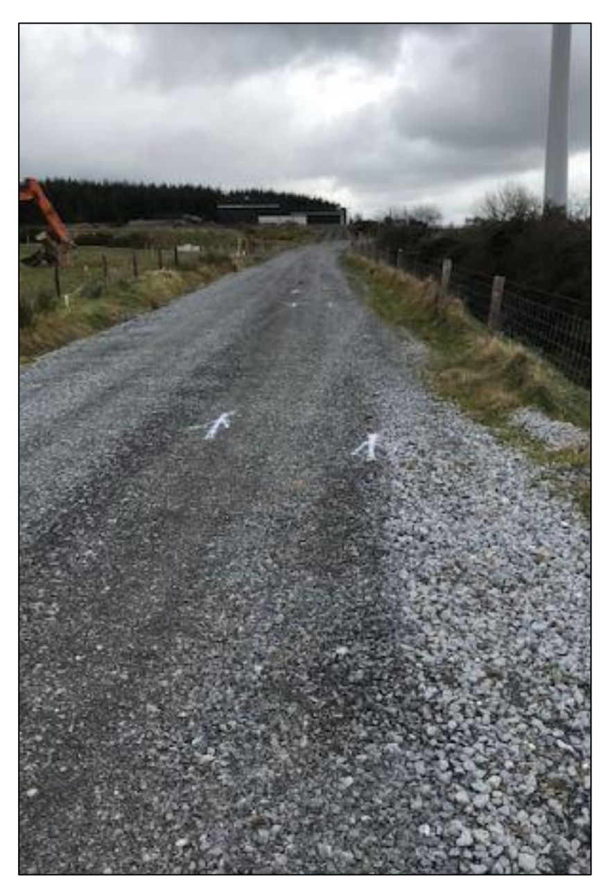
Figure 3.4: Typical Access Track